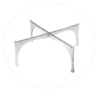
Grill Grate Risers